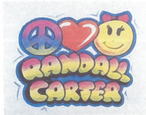
Funwear Girls' Design